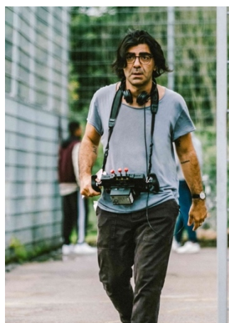
Fatih Akin

The internationally acclaimed director shares six films that fuelled his passion for cinema