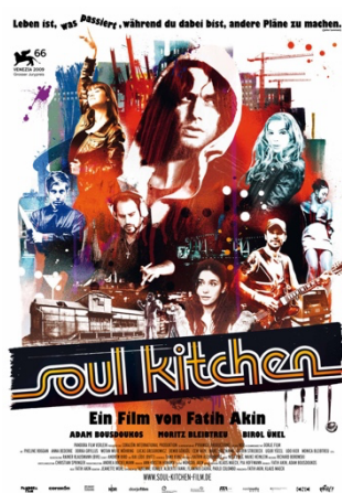
Soul Kitchen (Fatih Akin, 2009)