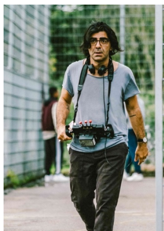
Fatih Akin

The internationally acclaimed director shares six films that fuelled his passion for cinema