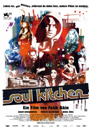
Soul Kitchen (Fatih Akin, 2009)