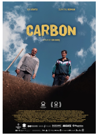
Carbon (Ion Borş, Republic of Moldova/Romania/Spain, 2022)